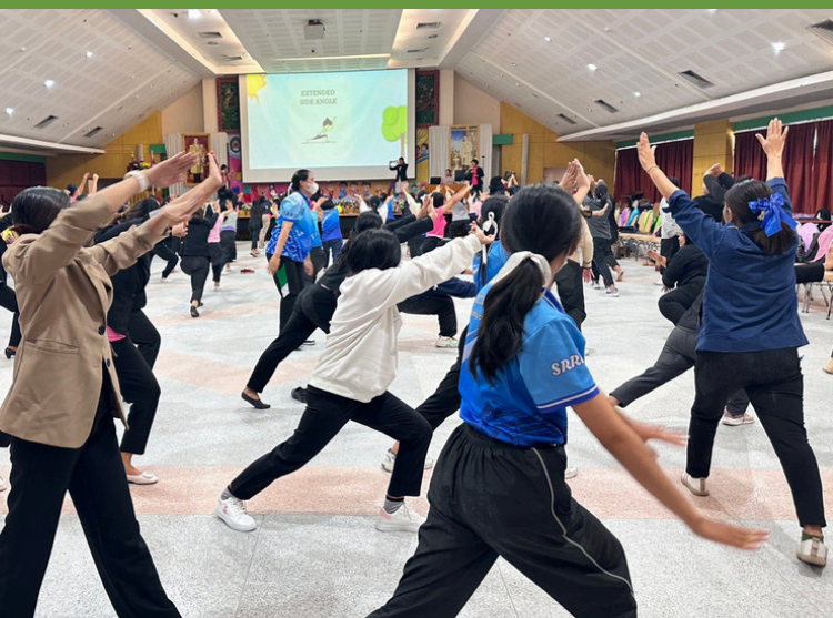
November 21, 2023: "Learning through Games" during the teachers' training session.

Plans for 2024 include a further two five-day training events plus a number of shorter more advanced training events focused on teachers that have already gone through the basic in-service training program and would like additional training on particular topics, for example use of mobile phones. As with the basic training these events will be organized in close collaboration with relevant Provincial Administrations and Rajabhats and with additional technical support from the New International School of Thailand (NIST) and others.