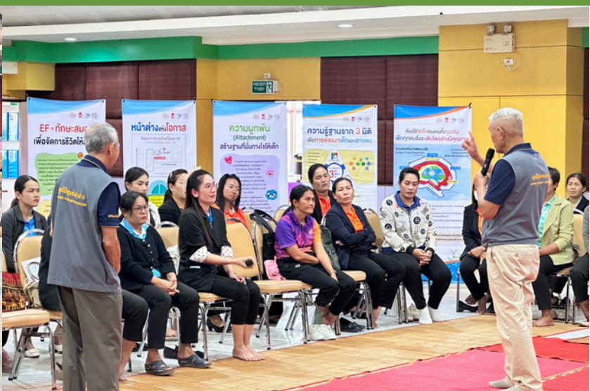
November 23 -24, 2023: A training event for ECD teachers with a focus on helping teachers develop facilitation skills.