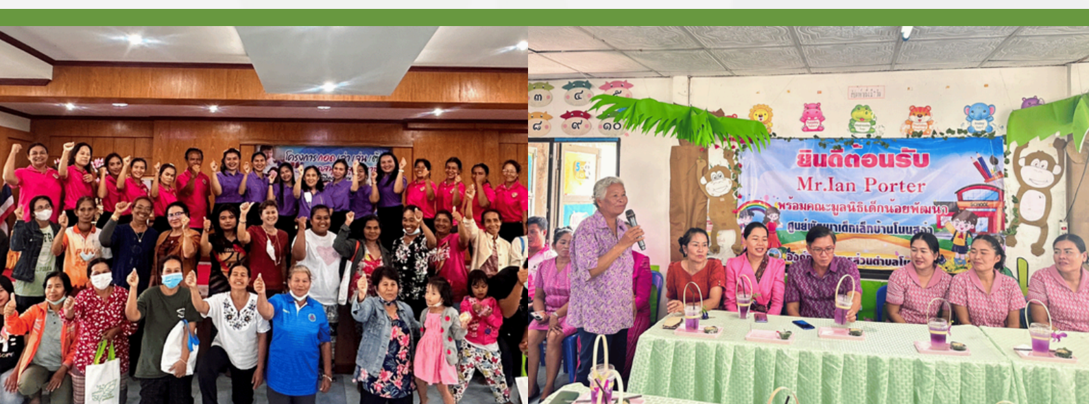
August 4, 2023: Information sharing session with parents at Bukraeng Wittayakom School, ECD center network in Chomphra district.

This increased engagement with a broad range of stakeholders will continue into 2024 and beyond. Drawing on the feedback received to date, DNPF in collaboration with SRRU is also organizing a five day workshop for teams from across the province. This workshop is being organized in collaboration with experts in community engagement and facilitation and will support teams in developing facilitation skills and learning from the experiences of others.