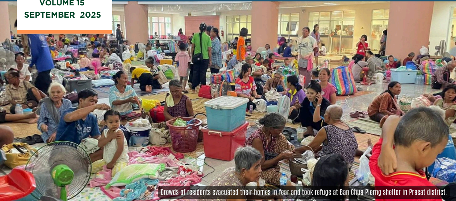
Crowds of residents evacuated their homes in fear and took refuge at Ban Chua Plerng shelter in Prasat district.

The latest news and updates from Dek Noi Pattana Foundation